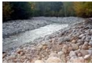
John's Brook after heavy equipment.